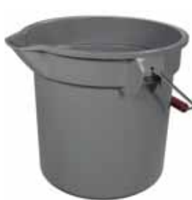
M9550 / HJ310

Double Pail – 17 quart • Size: 14 5 / 8 "L x 13 7 / 8 "W x 10 1 / 8 " H • Color: grey Stock No.: 2617 • Comp No.: RM2617GRY.....$21.50 /ea.