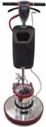
Stone Scrub Machine