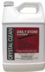
Crystal Clean Daily Cleaner